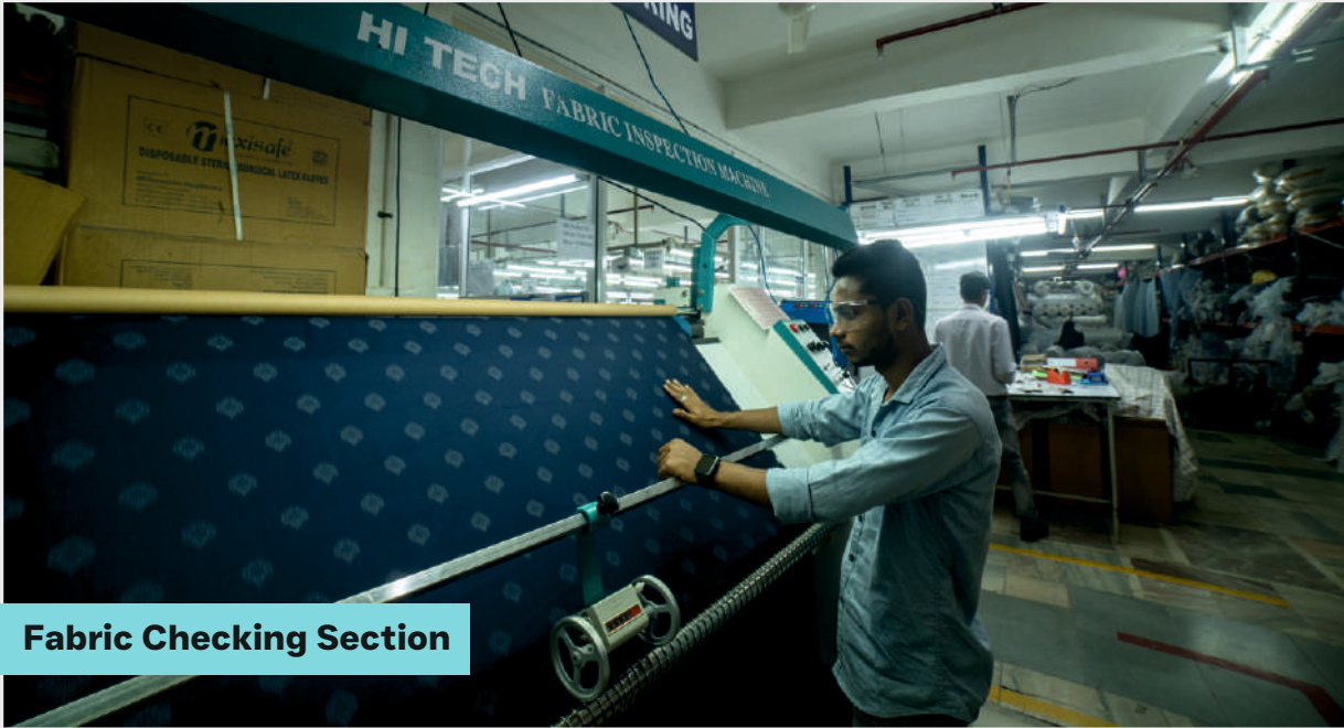
Fabric Checking Section